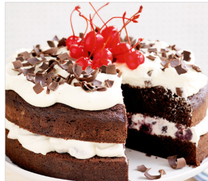
BLACK FOREST CAKE