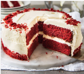
RED VELVET CAKE