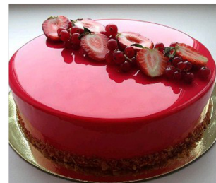
MIRROR GLAZE CAKE