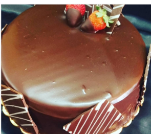
CHOCOLATE GANACHE CAKE