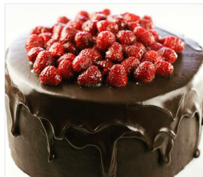
CHOCOLATE & RASPBERRY CAKE